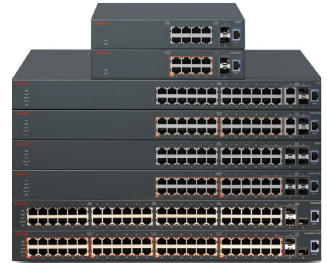
Figure 1: The ERS 3500 product family

It also supports IEEE 802.3at Power over Ethernet Plus (PoE+) which can power IP phones, wireless access points, surveillance cameras and other devices. PoE+ with its 32-watt power budget ensures investment protection for current as well as future high-powered end points.