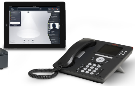
Figure 2: ERS 3500 with IP Office, the Avaya Flare® Communicator for iPad Device and an Avaya 9600 handset

automates the entire set up process on the ERS 3500 switch by utilizing LLDP or ADAC functionality to automatically set up voice and data VLANs, QoS and policies on the IP phones, meaning that IP Office and IP Phones are ready to be connected immediately. This helps ensure fast setup and error free deployment according to Avaya best practices and consistency between different locations for large rollouts in multiple branch offices.