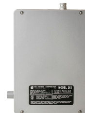
Isolation Barrier Model 263-000