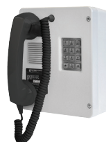
Indoor Model 262-001

...utilize an isolation barrier to reduce energy levels and eliminate the possibility of a spark or explosion. The barrier is placed in an indoor or outdoor, non-hazardous location up to one mile from the telephone. In contrast to explosion-proof telephones, which are designed to contain an explosion, our Intrinsically-Safe Telephones limit input power to prevent an explosion from occurring.