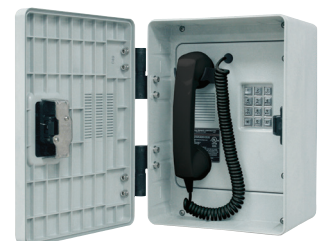
Outdoor Model 272-001