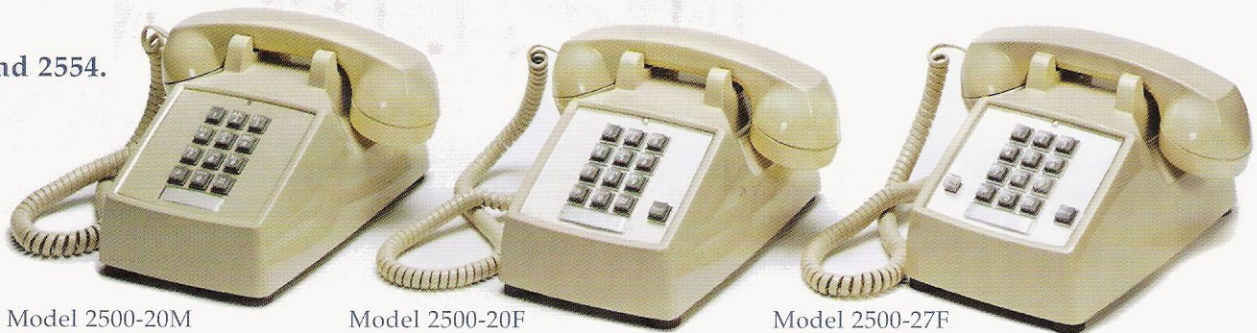
Model 2500-20M Basic