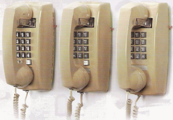
Model 2554-27F Flash/Message Waiting