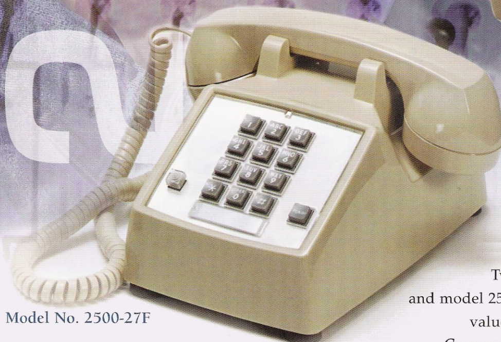
Model No. 2500-27F

Communications couldn't be simpler - or more dependable.