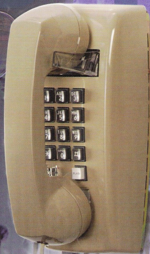
Model No. 2554-27F